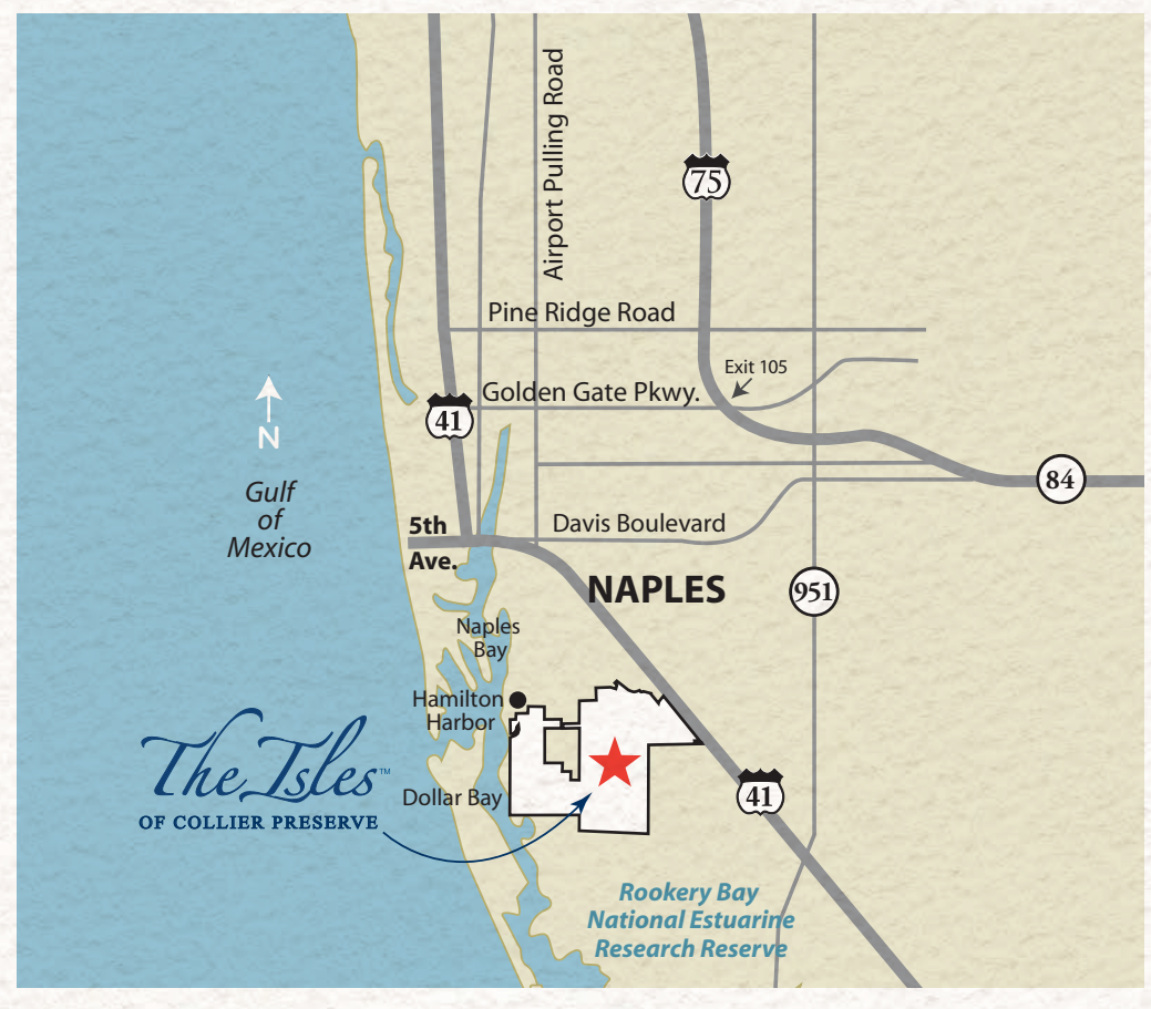
From I-75, take Exit 105 and travel west on Golden Gate Parkway to Airport Pulling Road. Exit to the right, then turn left onto Airport Pulling Road and continue 3 miles to Tamiami Trail East (US 41). Turn left and continue 2.5 miles to The Isles of Collier Preserve entrance on the right.