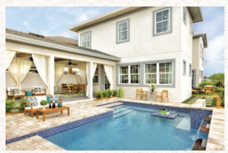
Laureate Park at Lake Nona, Orlando, FL