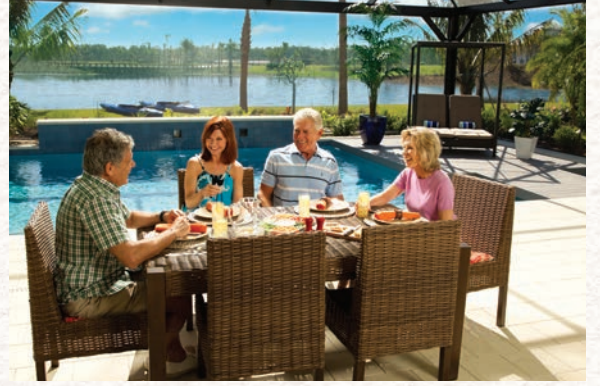
Active outdoor lifestyle