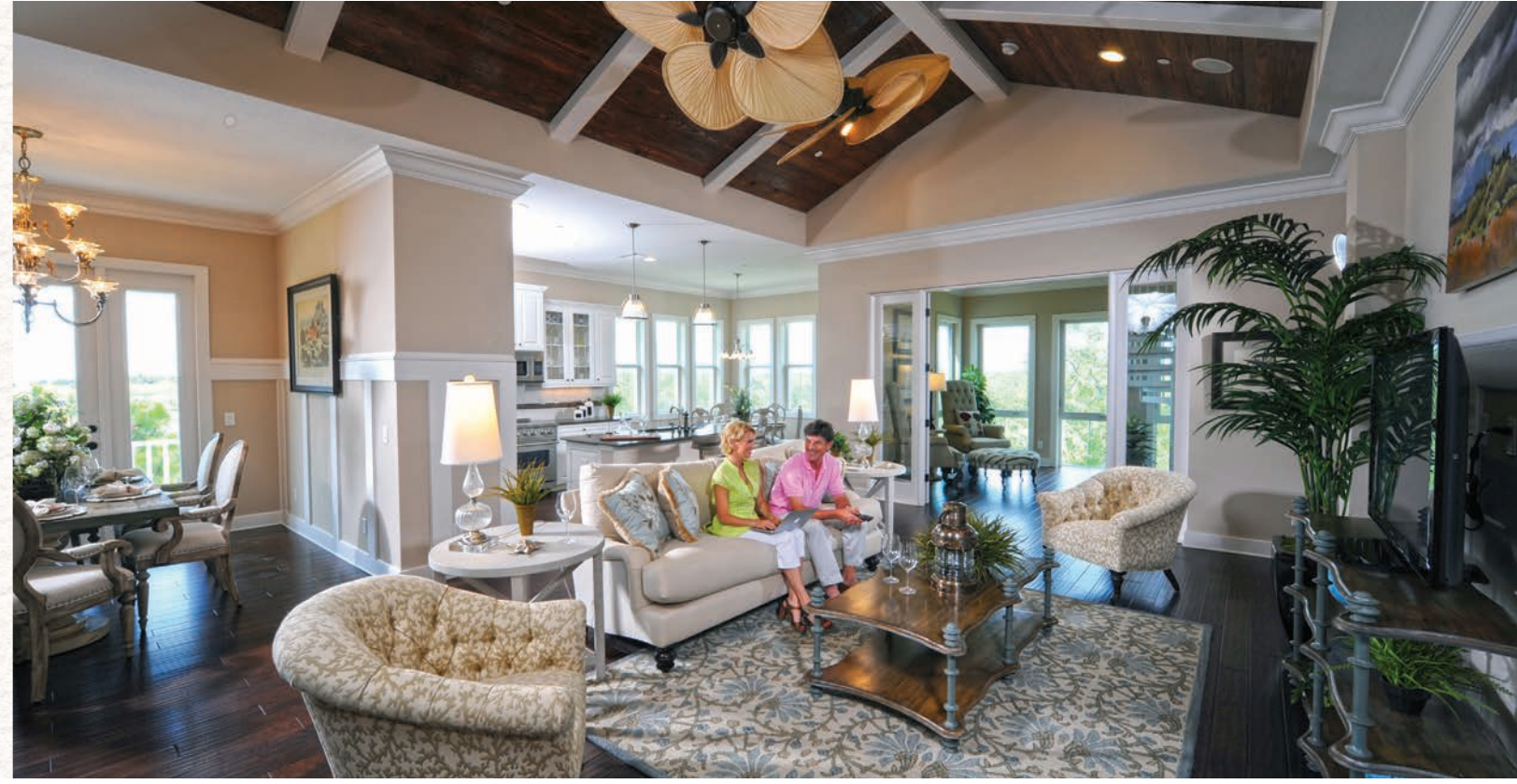
Harbour Isle, Bradenton, FL